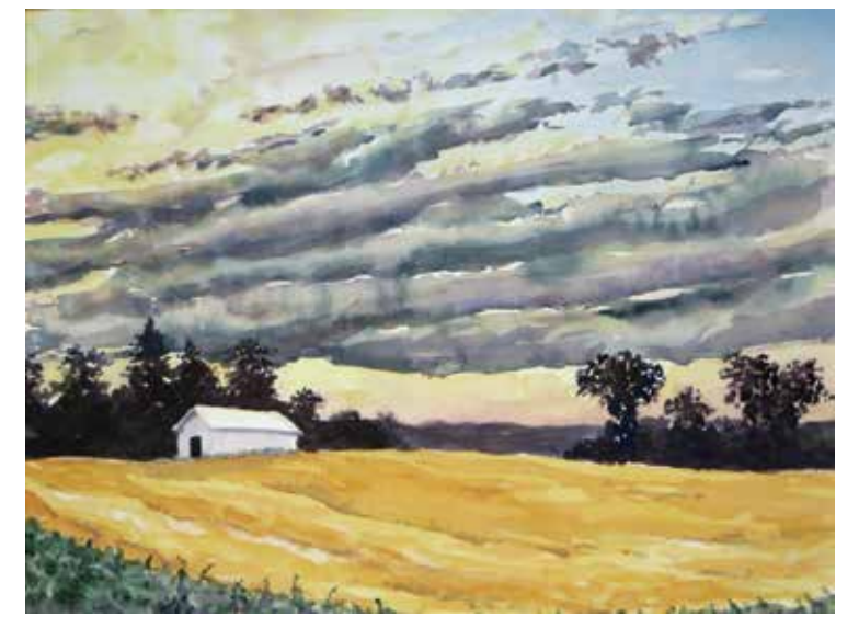
James McKnight* Watercolors Studio 10