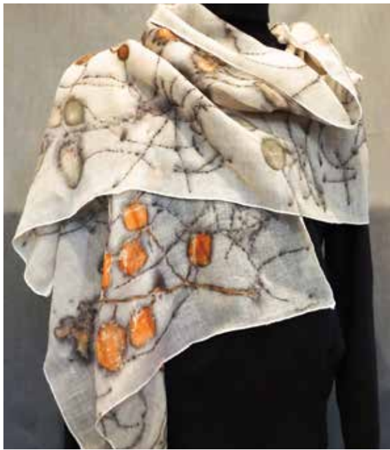
Debby Henning Fiber Studio 5