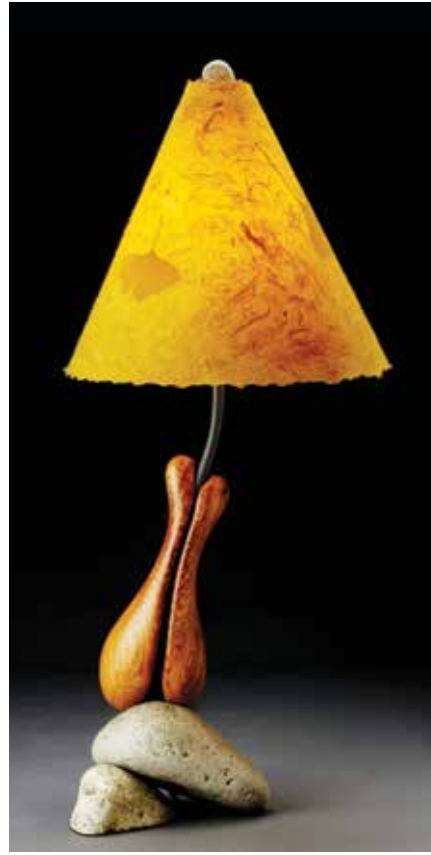
Paul Klein* Sculptural Lighting Studio 8