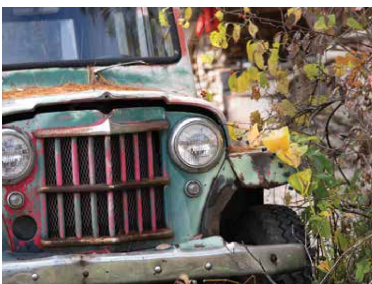
John Morser Photography Studio 7