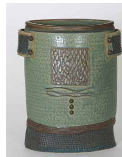
Linda Sheard Pottery Studio 3