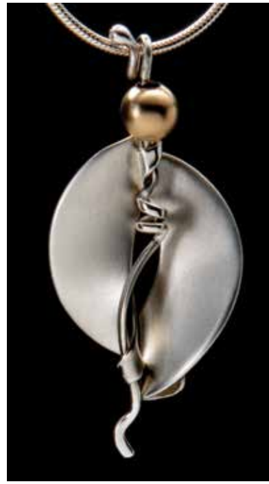
Brenda Gingles* Silver Jewelry Studio 5