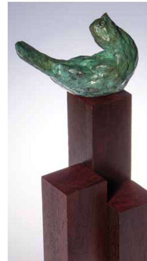
Gene Reinking* Bronze Sculpture Studio 3