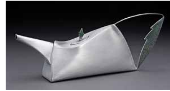
Rebecca Hungerford Pewter Studio 2