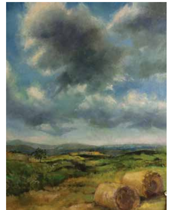
Kristie Cecil Painting Studio 8