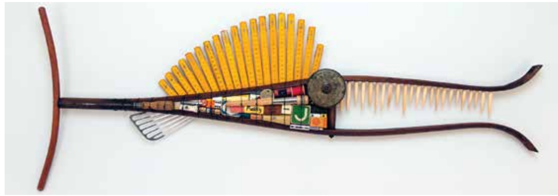
Steven Palmer Found Object Fish Studio 2