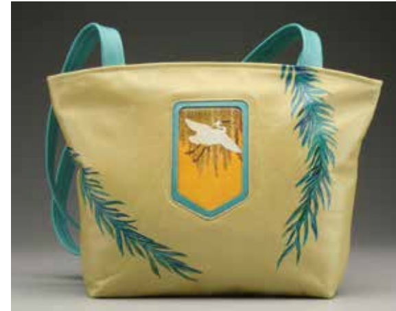
Pam Bronk Leather Studio 5