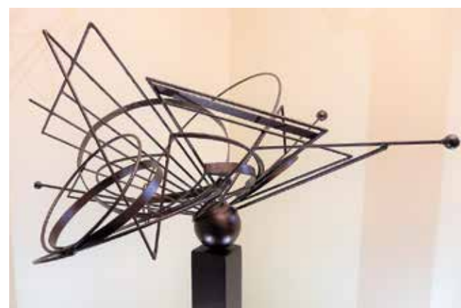
Curtis Archer* Metal Sculpture Studio 1