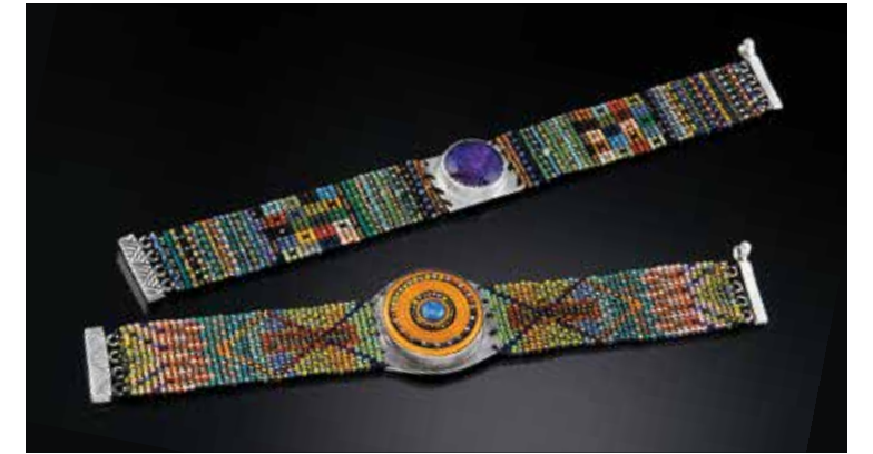
Laurie Shovers Anodized aluminum jewelry with hand beaded elements Studio 4