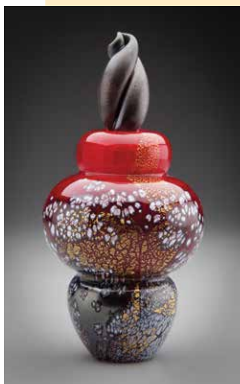
Sharon Fujimoto* Blown Glass Studio 7