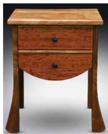
Patrick J Plautz Furniture Studio 8