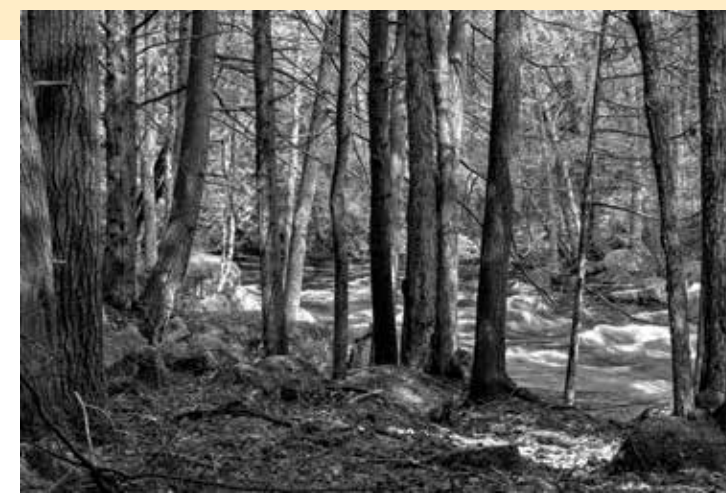
Robert Rosen Photography Studio 9